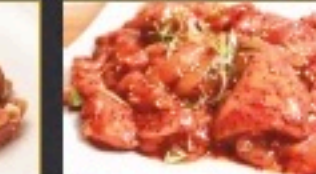
Spicy Chicken Bulgogi Thinly sliced and marinated chicken with spicy sauce