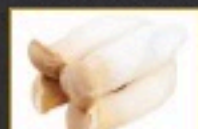
King Oyster Mushroom