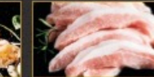
Signature Pork Cheek (Dinner Item)