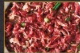
Beef Bulgogi Thinly sliced and marinated beef