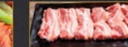
Pork Belly Regular style sliced pork belly