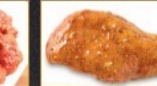
King Pot Chicken Chicken breast with house special marinade