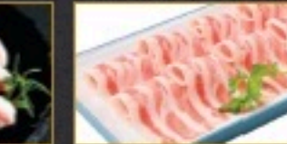
Sliced Pork Belly