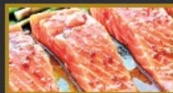
Spicy Salmon Marinated salmon with spicy sauce (Dinner Item)