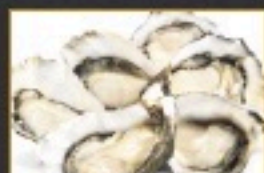
Fresh Oyster (Dinner Item)