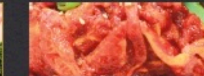
Spicy Pork Bulgogi Thinly sliced and marinated pork with spicy sauce