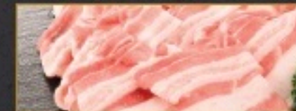
Seoul Pork Belly Premium Pork Belly