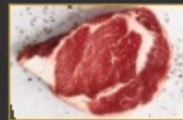
Seoul Steak (Dinner Item)