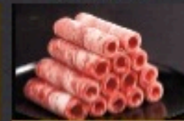
Sliced Beef Belly