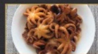
Spicy Baby Octopus