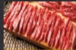
Finger Ribs (Dinner Item)