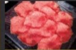
Beef Tongue (Dinner Item)