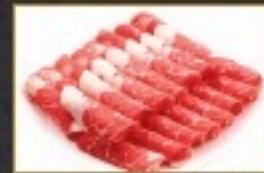
Sliced Eye Round Steak