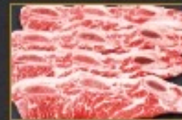
Seoul Short Rib (Dinner Item)