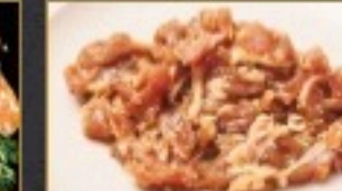
Chicken Bulgogi Thinly sliced and marinated chicken