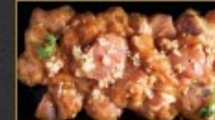
Garlic Chicken Marinated chicken with garlic sauce