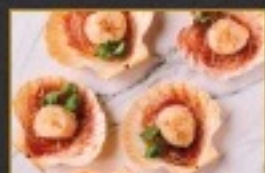
Scallop (Dinner Item)