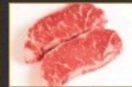
Premium Ribeye Steak (Dinner Item)