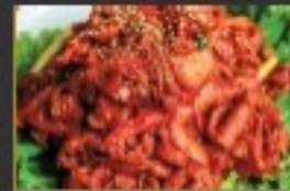
Spicy Beef Bulgogi Thinly sliced and marinated beef with spicy sauce