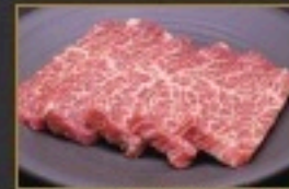
Angus Chuck Flap Tall (Dinner Item)