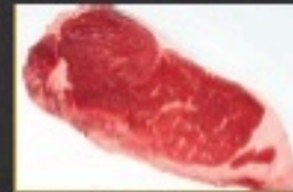
New York Strip Steak (Dinner Item)