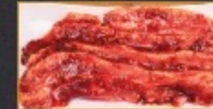
Spicy Pork Belly Marinated pork belly with spicy sauce