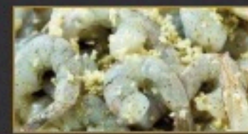
Garlic Shrimp Marinated shrimp with garlic sauce