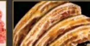
Smoke Garlic Pork Belly Smoked and marinated pork belly with garlic sauce