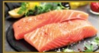
Fresh Salmon (Dinner Item)