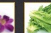
Green Leaf Lettuce